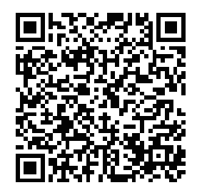
Please scan this QR code to win Anviz vCard