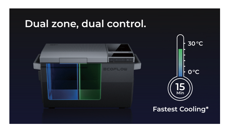
*Cooling at the optimum speed when empty

Equipped with a removable divider separating it into two zones, and independent temperature control, both sections can refrigerate and freeze from 50°F (10°C) to -13°F (-25°C). Whatever you want to stock up on, it shape-shifts to meet your needs.